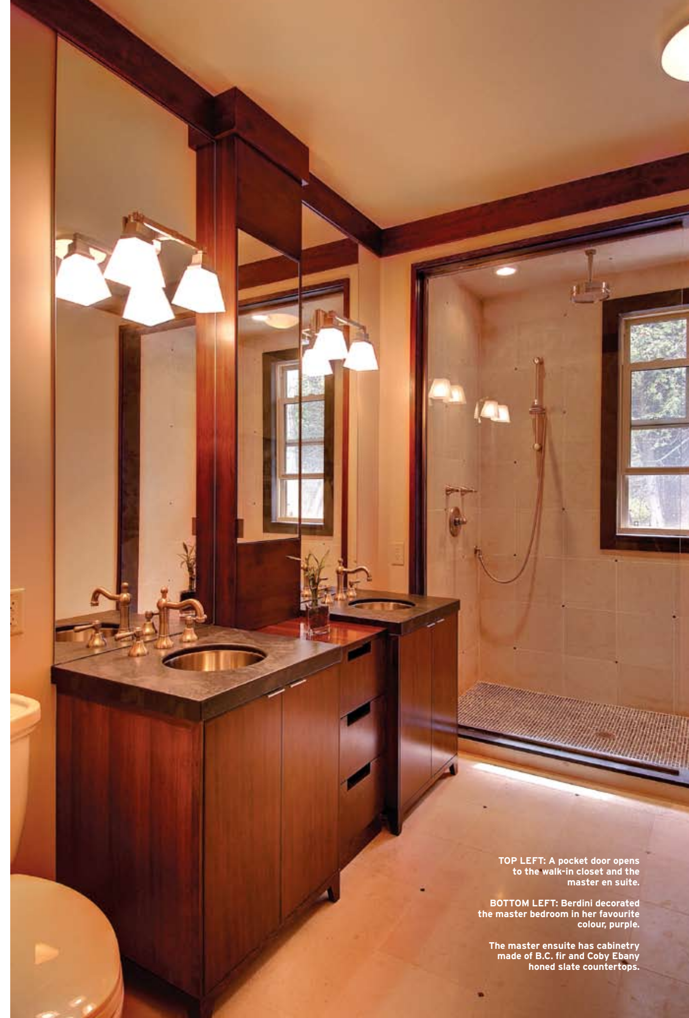
TOP LEFT: A pocket door opens to the walk-in closet and the master en suite.